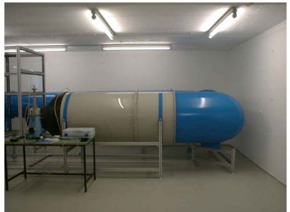
Wind tunnel D320 with LDA for profile measurements